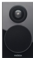
Mini G50 front