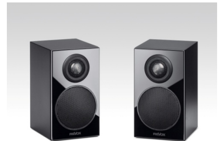
Mini G50 with black housing