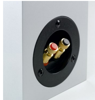
Shelf G70 terminals