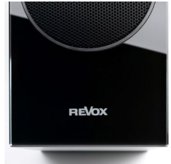
Shelf G70 logo