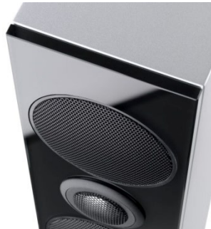
Shelf G70 front of glass